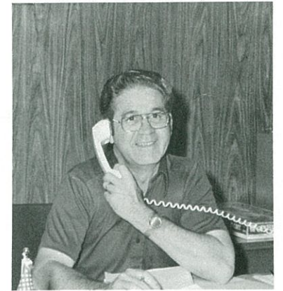
Jack K. Dorman Elementary Principal